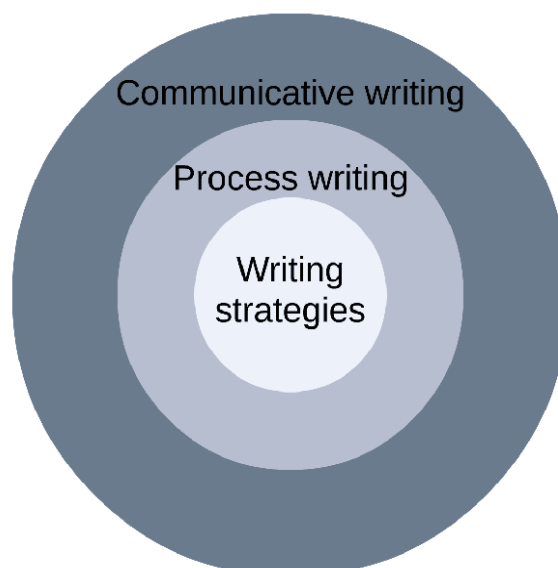
Figure 1. Three embedded approaches to the teaching of writing in the comprehensive writing program.

In the comprehensive writing program we focused on communicative aspects of writing, on writing as a process, and on the teaching of genre-specific writing strategies for five functions or genres; description, instruction, explanation, argumentation, and narration. Figure 1 visualizes how the three approaches were linked in the comprehensive writing program.